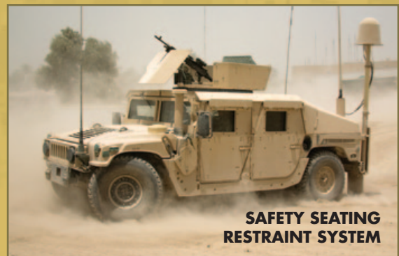
SAFETY SEATING RESTRAINT SYSTEM