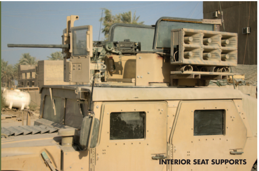
INTERIOR SEAT SUPPORTS