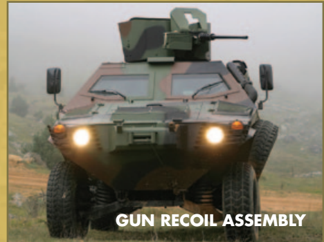
GUN RECOIL ASSEMBLY