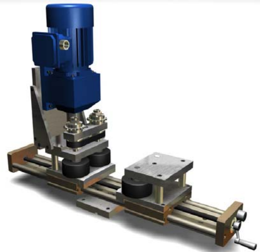
Uni-Guide Power Feeder.

Outfitted with the same FrelonGOLD® liner as the Simplicity linear bearing, the Uni-Guide is fully capable of withstanding a multitude of environmental obstacles that cause conventional linear guide systems to seize up and fail. Dirt, dust, wooden or metal chips, fluids, and any other contaminants all DO NOT effect the performance of the Uni-Guide. Extreme temperatures and shock vibration also do not interfere with the system's overall performance. With no added grease or oil necessary, the self-lubricating Uni-Guide provides reliable precision linear motion throughout the entire life of the product.