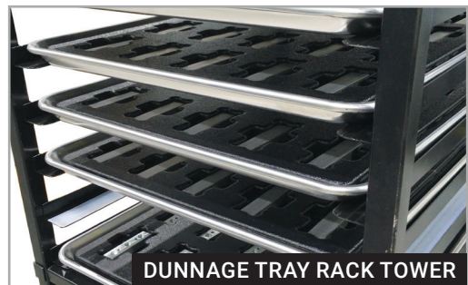
DUNNAGE TRAY RACK TOWER