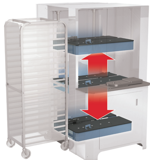
VERTICAL-PRECISION AUTOMATED TABLE