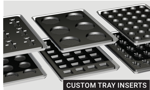
CUSTOM TRAY INSERTS