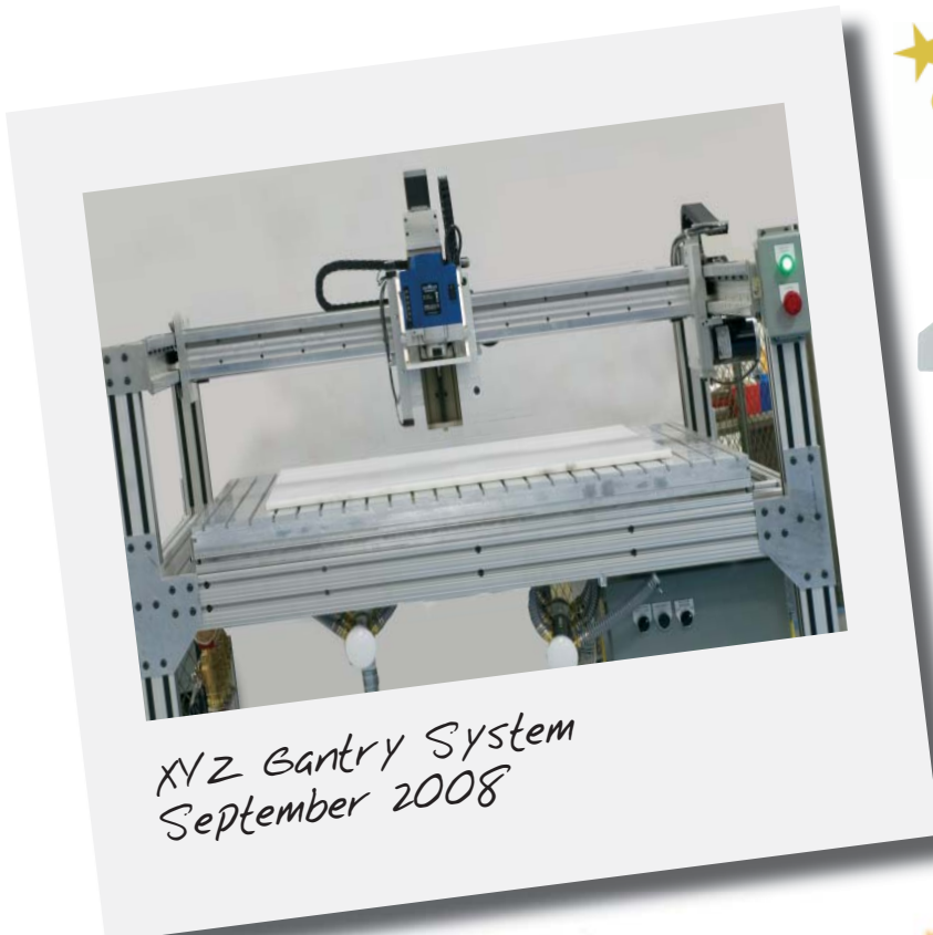
XYZ Gantry System September 2008

2008 design news GOLDEN MOUSETRAP Finalist